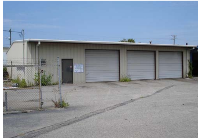
3 overhead doors across the front facing Morrison Dr