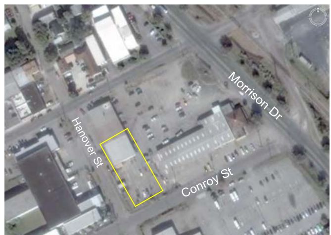
Great access to major transportation arteries

* No warranty or representation is made as to the accuracy of the information contained herein *