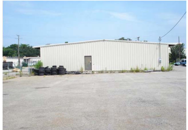
Includes large side parking lot