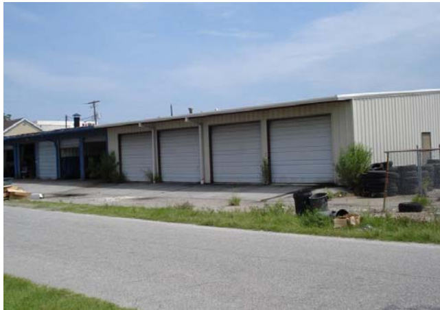
4 overhead doors off Hanover Street