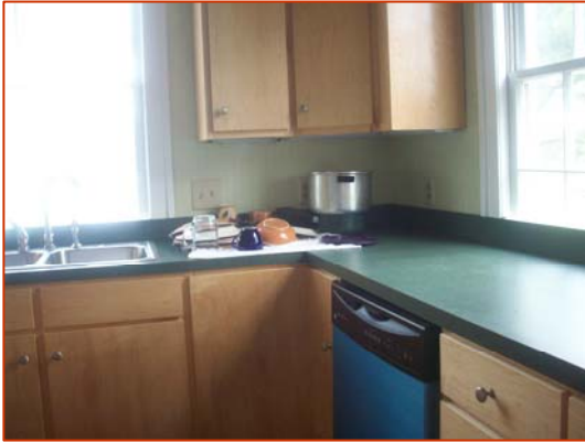
Kitchen upper level