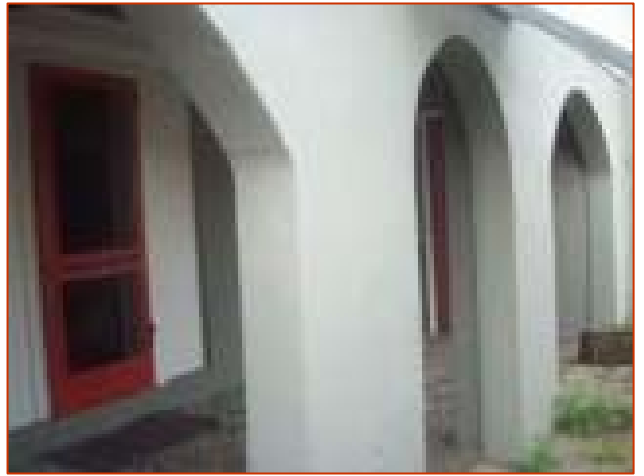
Rear entrance, lower level,