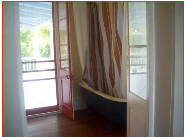
Bathroom, 2 nd bedroom, upper level