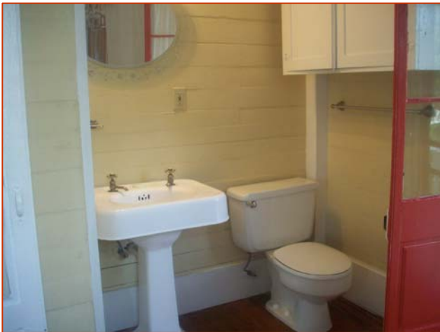
Bathroom, 2 nd bedroom, upper level