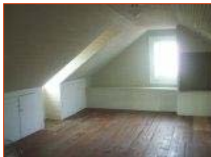
3 rd floor master bedroom