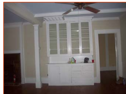
LR built-in cabinet upper level