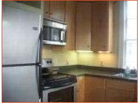
Kitchen upper level