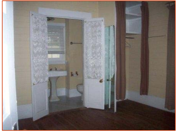
1 st bedroom, upper level