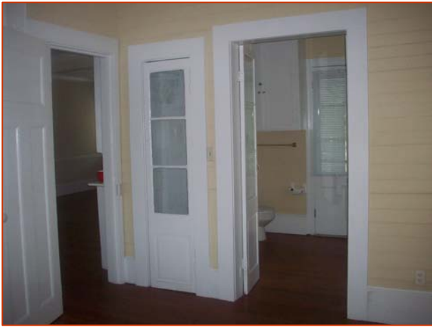
2 nd bedroom, upper level