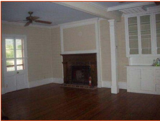
Living room upper level