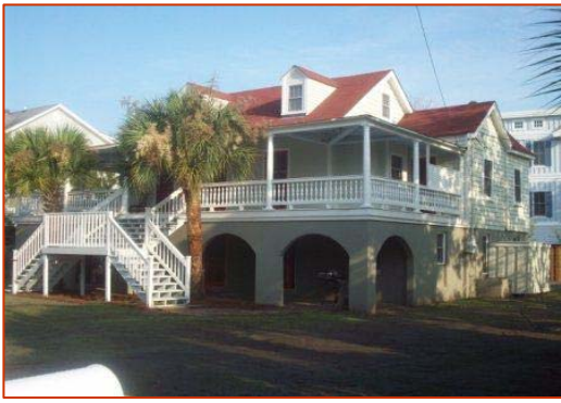
Exterior 2114 l'On