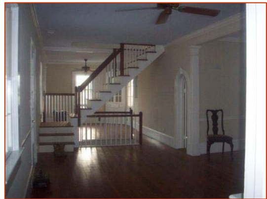
Living room upper level looking toward kitchen