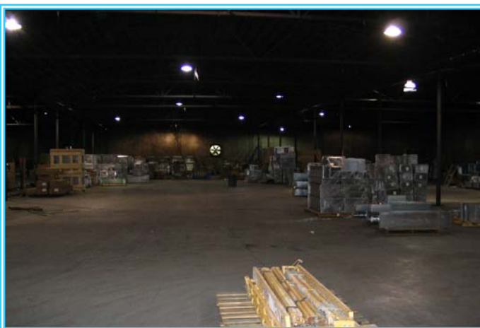
Open floor plan with flexible layout options