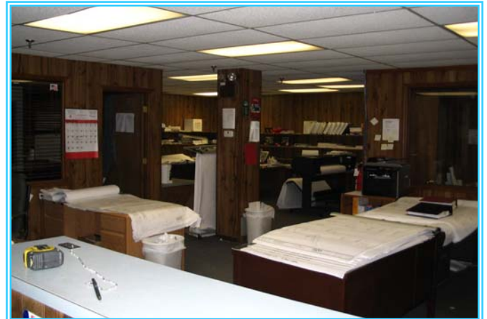
Approximately 1,500 sq.ft. of office space