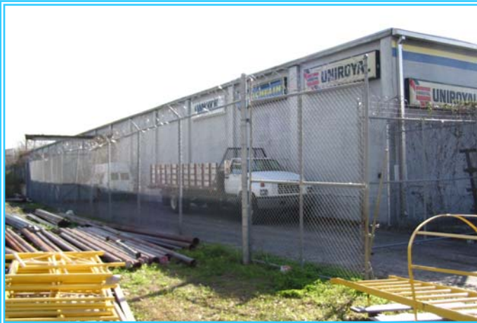
Fenced side yard with loading dock & overhead door