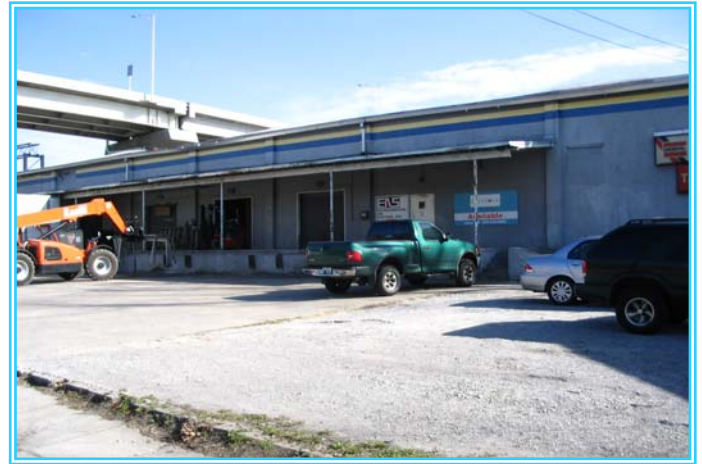
Dock high loading with four 8x8 overhead doors