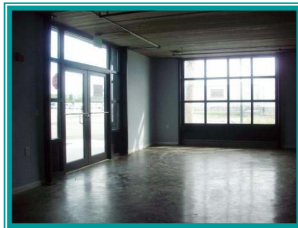
1 st floor

Easy to find location for your clients near foot of Ravenel Bridge.