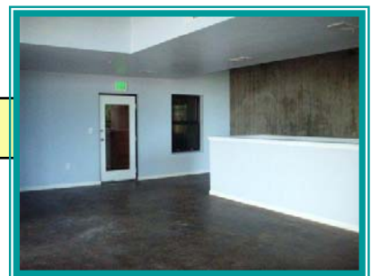
2 nd floor

2 nd floor consisting of 1,100 s.f. may be used as a live/work unit or used as all office