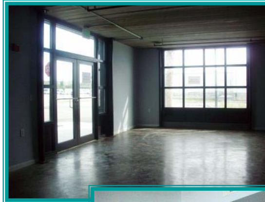
1 st floor

Easy to find location for your clients near foot of Ravenel Bridge.