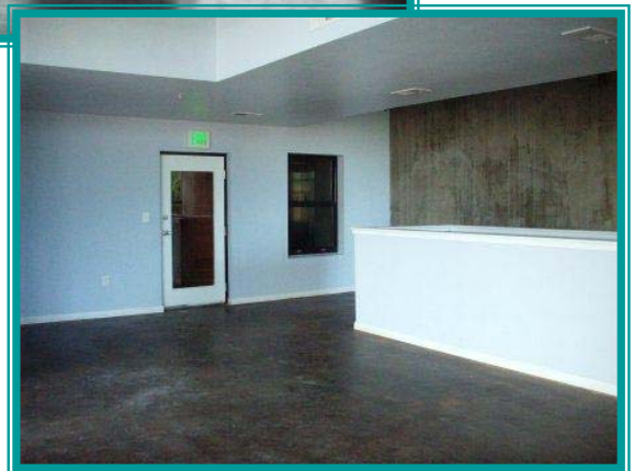
2 nd floor

2 nd floor consisting of 1,100 s.f. may be used as a live/work unit or used as all office